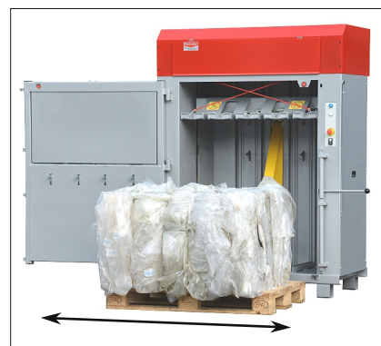
The main door of the NP80P-II can be fully opened (180°) so that the bale can be easily removed even in small spaces.