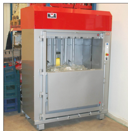
The feed door is opened 90° as standard but can be opened all the way down 180°, adjusted to your needs.