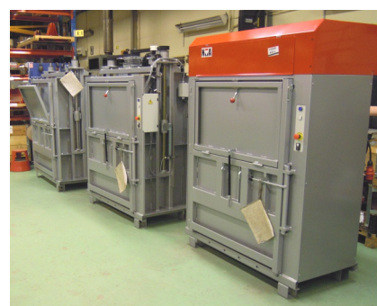
Since the mid-sixties more than 15,000 balers have been delivered all over the world.

All compactors from NVA carry the CE-mark.