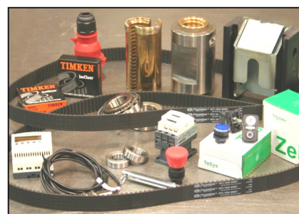
Components from global world class suppliers ensure quality and availability.