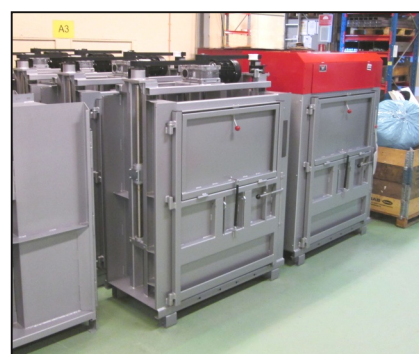
Since the mid-sixties more than 15,000 balers have been delivered all over the world.