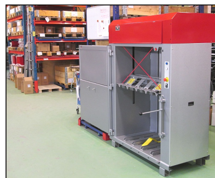
The door of NP80-II can be fully opened (180°), so that the bale can be easily removed even in small spaces.