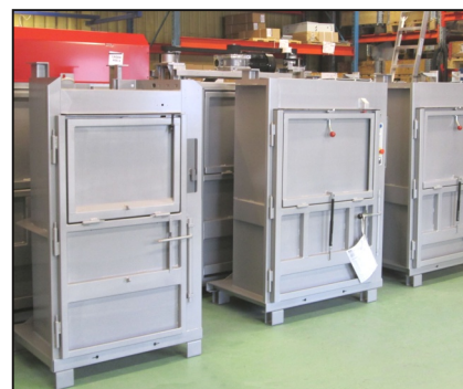
Since the mid-sixties more than 15,000 balers have been delivered all over the world.