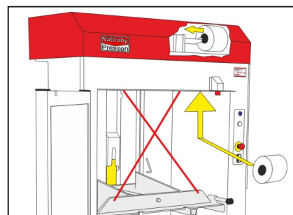
The bale strapping rolls are easily reached at the front. Each roll can be replaced separately.