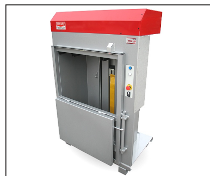
The feed door opens 90° as standard, but can be opened all the way down 180° for customized needs.