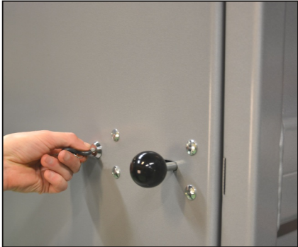
The NP4W is equipped with a feed door lock.