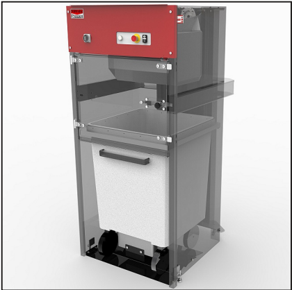
The NP4W has a compact and unique construction. This gives a silent-running machine with small outer dimensions, easily located.