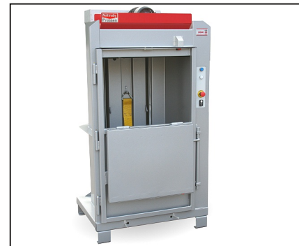
The feed door opens 90° as standard, but can be opened all the way down 180° for customized needs.