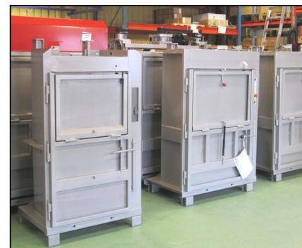
Since the mid-sixties more than 15,000 NVA balers have been delivered all over the world.