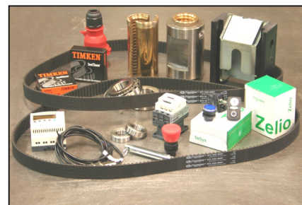
Components from global world class suppliers ensure quality and availability.

All compactors from NVA carry the CE-mark.