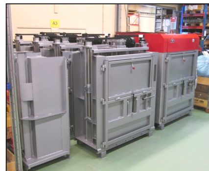
Since the mid-sixties more than 15,000 balers have been delivered all over the world.