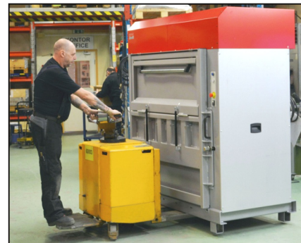
By a pallet truck the machine can be moved from side or front - rationally for placement and simplifies cleaning.