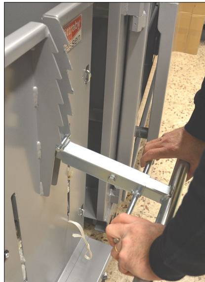
The press ram is automatically locked in its down position, keeping the material under pressure. The press ram is released by a quick hand grip.