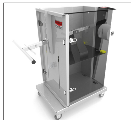
A long stroke length with constant pressure drives out the air and provides compact bales

Our continuous development in close co-operation with users world wide gives us a unique knowledge of compacting and recycling.