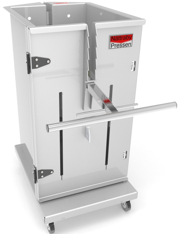
NP10 is easy to locate/relocate where it is needed the most. The wheels are lockable.