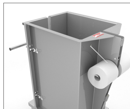
Two bale strapping rolls are placed at the back of the press.