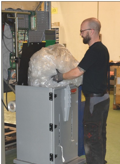
Load the material into the chamber and push the press ram down.