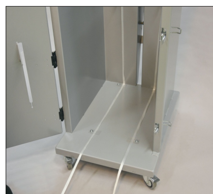
The bale strapping is pulled down along the chamber floor and attached at the front.