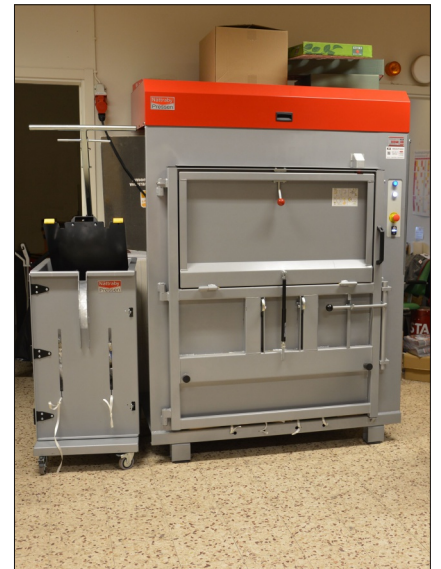
Use an NP10 together with a Nättraby baler, for compacting paper/cardboard, for a complete waste solution.