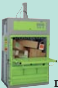
DIXI 25, 30 S

Compaction force 18 t Bale weight 120-180 kg