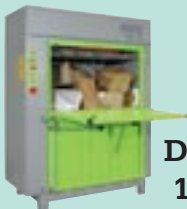
DIXI 18 S

Compaction force 8,5 t Bale weight 50-80 kg