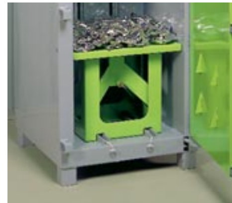
Adaptor to compact cans (Special equipment)