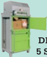
DIXI 5 S-K

... with a compaction force of 4 t – the proven, economical, hydraulic compact baler