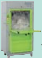
DIXI 10 S

Compaction force 6 t Bale weight 40-60 kg