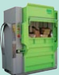
DIXI 60, 80 S

Compaction force 25-30 t Bale weight 250-360 kg